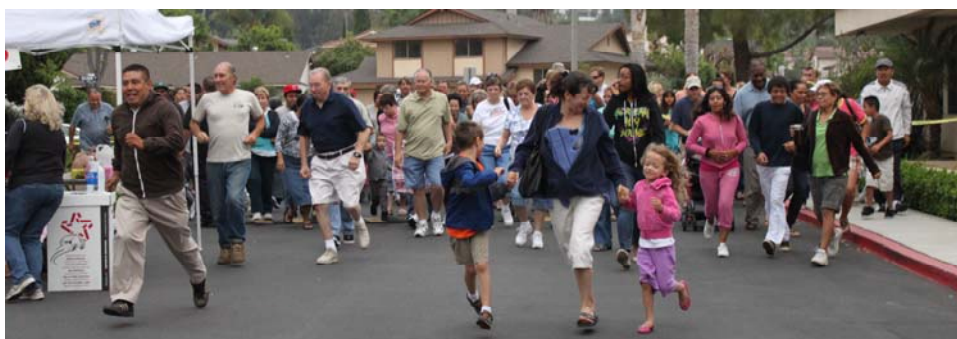
The RACE is ON!! Friday, August 12, 7:00 am, people of all ages, scrambled to find their treasures at Garage Sale. Over $25,000 in sales for the weekend.