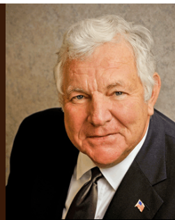
Featuring: Bill Bennett, Former U.S. Secretary of Education