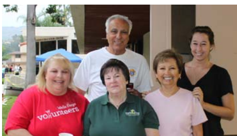
Monks Closet sales: $5,775

We made over $25,000 before expenses making this one of our most successful Garage Sales ever! Our